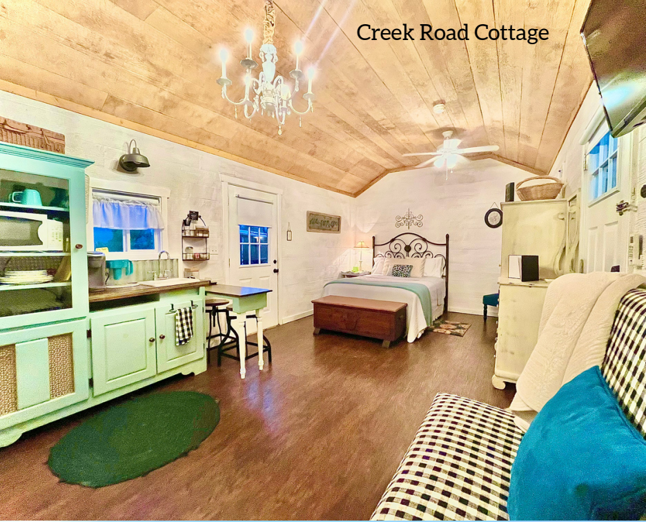
Creek Road Cottage